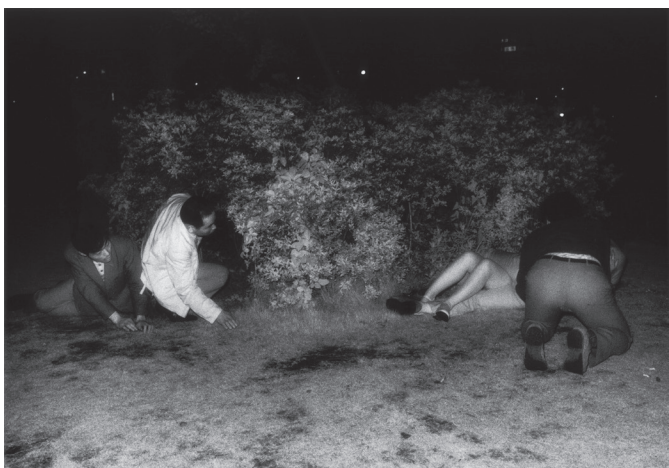
Images left column (from the top): Kohei Yoshiyuki, Untitled , 1979 Kohei Yoshiyuki, Untitled , 1971 Kohei Yoshiyuki, Untitled , 1971 All images from the series The Park , gelatin silver print, 11"X 14" © Kohei Yoshiyuki, Courtesy Yossi Milo Gallery, New York