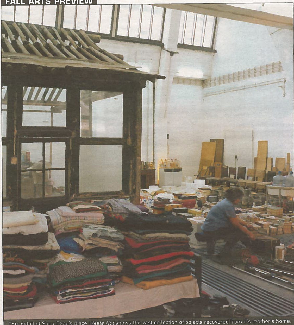
This detail of Song Dong's piece Waste Not shows the vast collection of objects recovered from his mother's home.