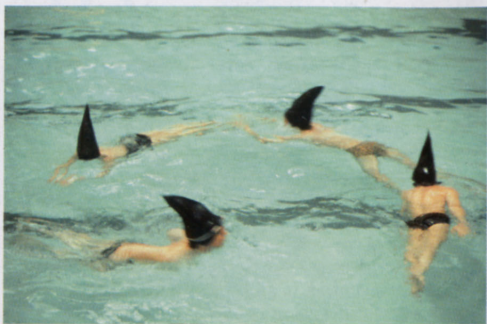
New York Corres Sponge Dance School of Vancouver (1972), still photograph from performance [Presentation House Gallery, North Vancouver BC, Sep 11-Nov 7]