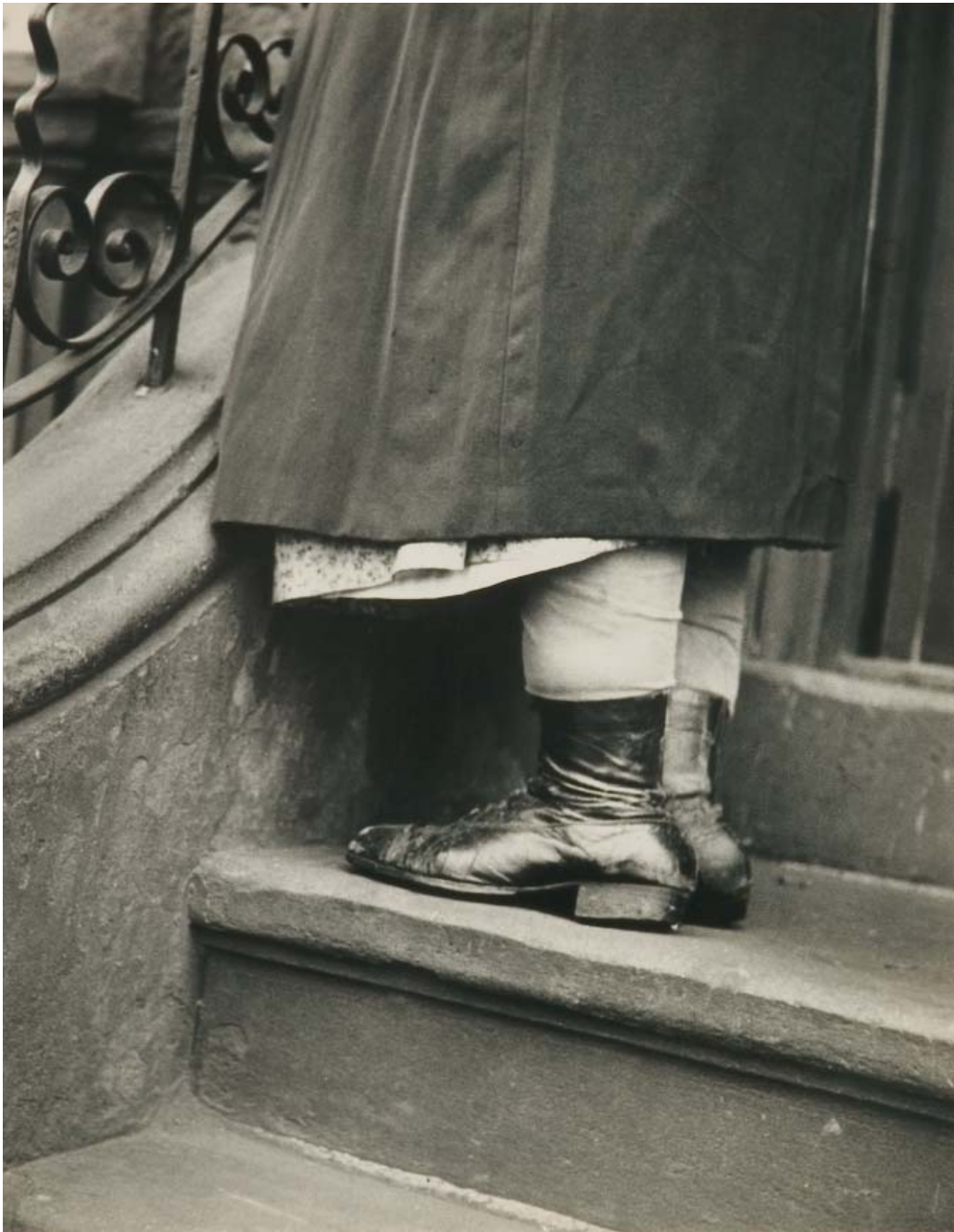
Leon Levinstien, Untitled , (shoes on stairs), nd, gelatin silver print.