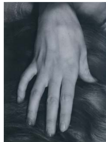
image left: Man Ray, Untitled (hand in hair), c 1920's, gelatin silver print