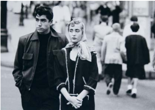
Robert Frank, Chattanooga, Tennessee , 1956, gelatin silver print