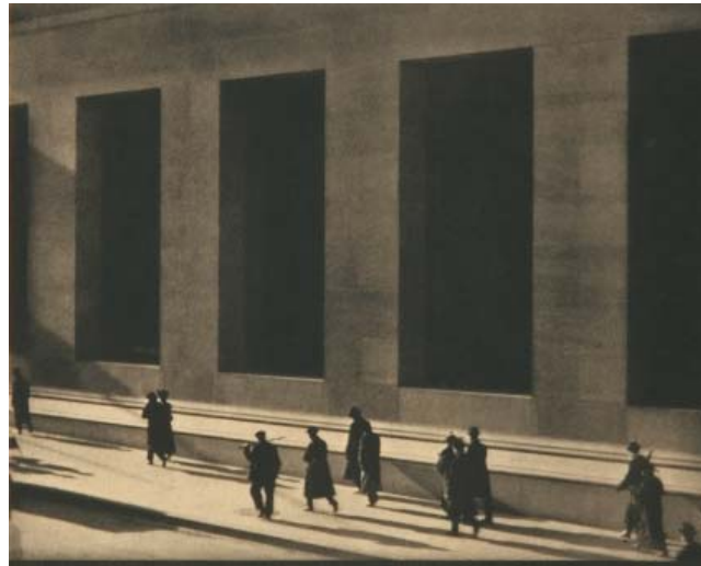
Paul Strand, Wall Street , 1915, photogravure

FOR MORE IMAGES please contact Diane Evans 604 986 1351 or devans@presentationbousegall.com