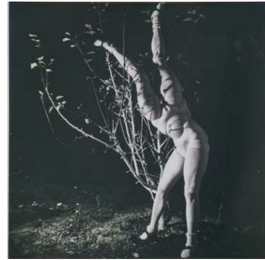
Hans Bellmer, La Poupée , 1937, gelatin silver print