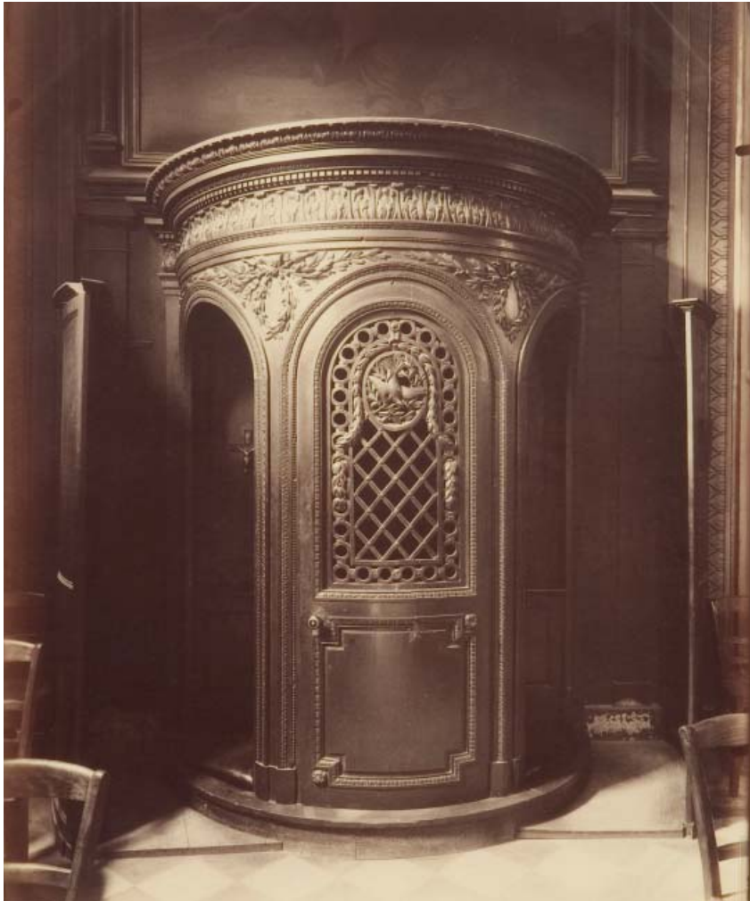
Eugene Atget, Le Confessional , c. 1900, albumen print