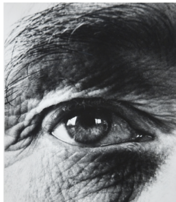
Bill Brandt, Henry Moore's Eye , c. 1964, gelatin silver print.

Opening Reception: Saturday, October 3, 2009, 6 pm