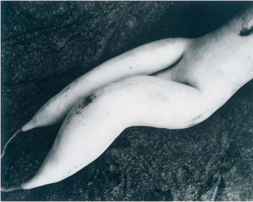
Edward Weston, White Radish , 1931, gelatin silver print