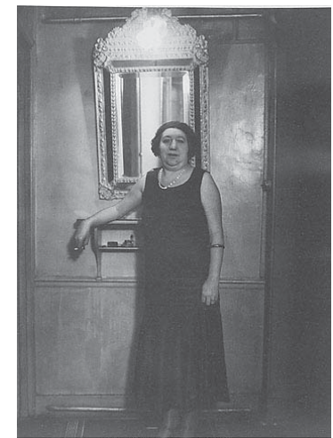
image right: (Gyula Halasz) Brassai, Madame , 1932, gelatin silver print