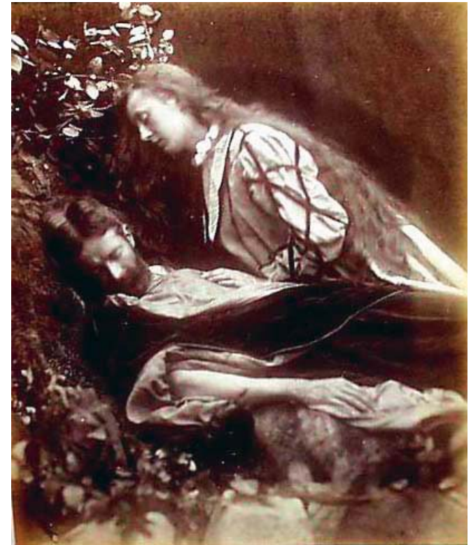
Julia Margaret Cameron, Gareth and Lynette , 1874, albumen print