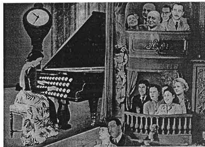
Sueño no. 18 "Café Concert", 1948

Born in 1904, Grete Stern lived and worked in Germany, England and Argentina. She studied at the Bauhaus and, before leaving Europe in the early 1930's, was a partner, with Ellen Auerbach, in the design studio ringl + pit in Berlin. She died last year in Buenos Aires.