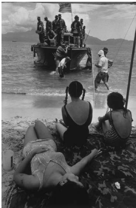
Marines Landing on Beach, Danang, 1970.