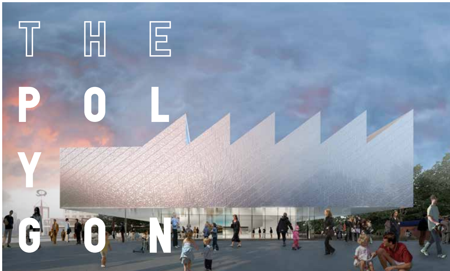
Rendering of The Polygon Gallery building, by Patkau Architects, 2016