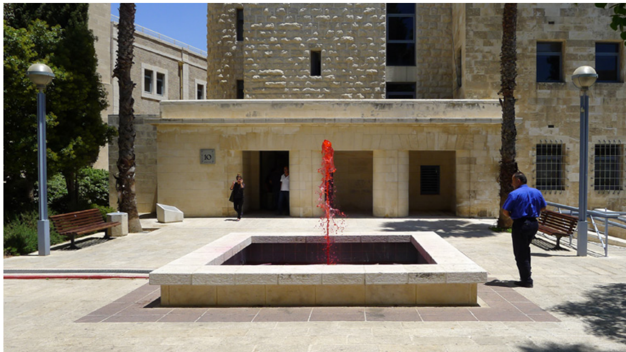
Reverse Joy, pigment in public water fountain (2012)