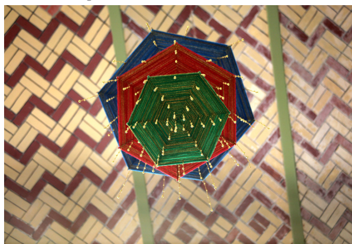
Pająk, materials variable, dimensions variable (2011)