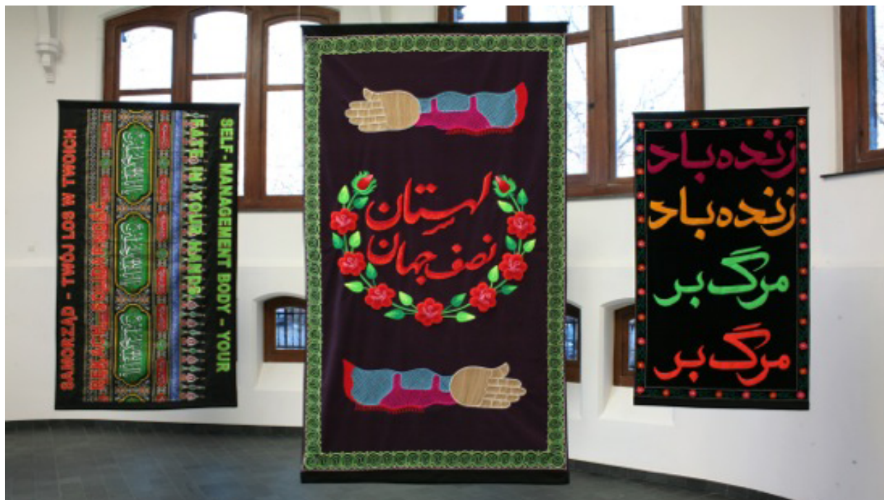
Friendship of Nations: Polish Shi'ite Showbiz (installation view)