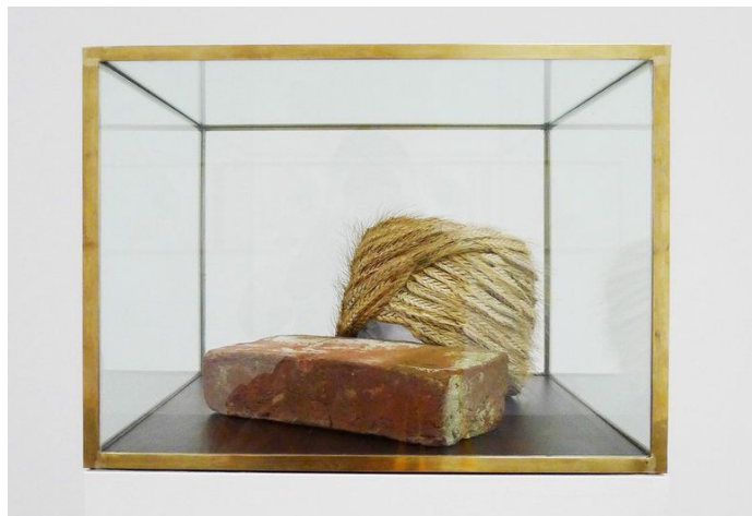
Wheat Molla, wheat, cotton, glue, brick, 45 x 35 x 25 cm (with glass and bronze case), 2011.