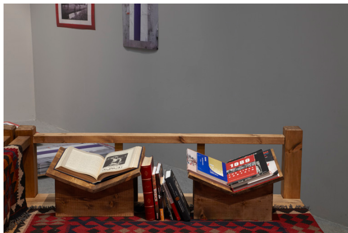
Dear 1979, Meet 1989. wood, carpets, book archive, variable dimensions (2011)