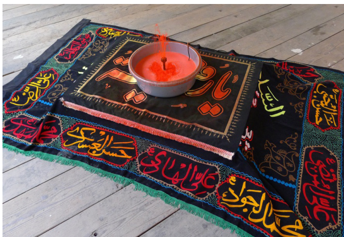
Reverse Joy (installation view), Emroidered fabric, tinted water (2012)