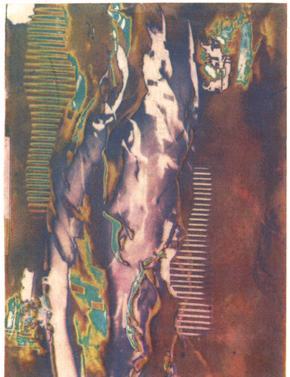
Jaroslav Rössler, Composition with colour gels , c1970, Plastic base, 31 x 41.5 cm