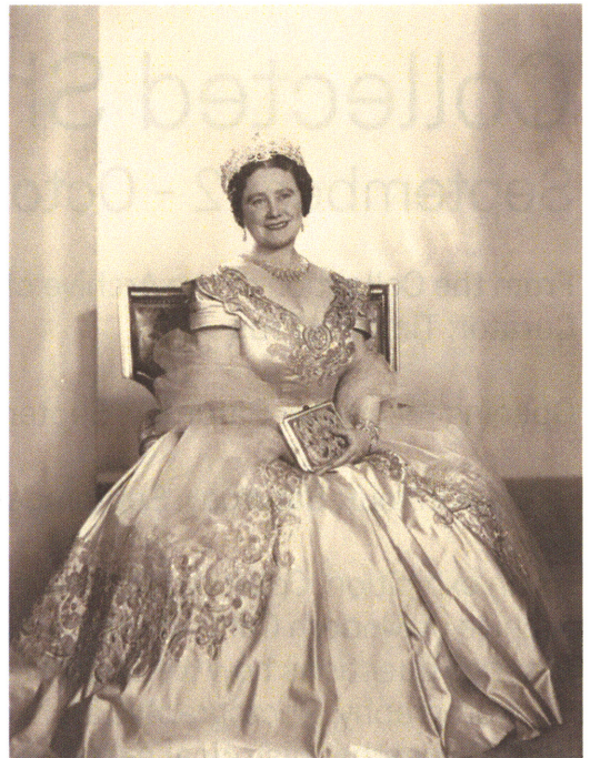
Dorothy Wilding, Queen Elizabeth the Queen Mother , c1954, Silver gelatin print, 42.5 x 54.5 cm, courtesy the Archive of Modern Conflict