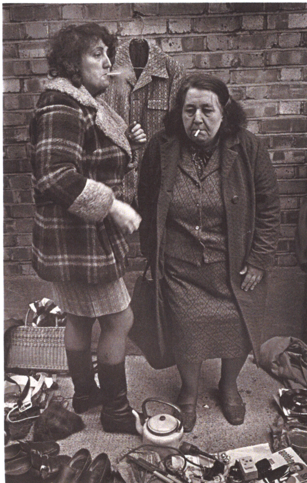
Markéta Luská cová, Two women selling teapots and other things off Cheshire Street, London , 1977, Silver print, 42.5 x 54 cm